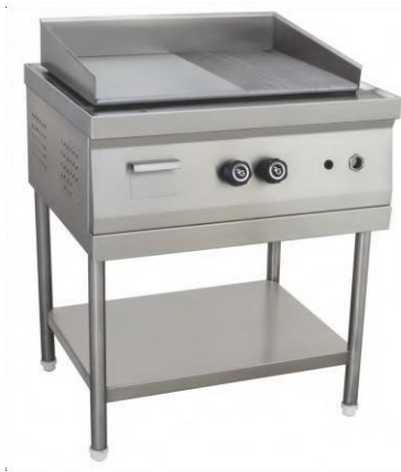
County Grill (griddle Plate) Size: Customized