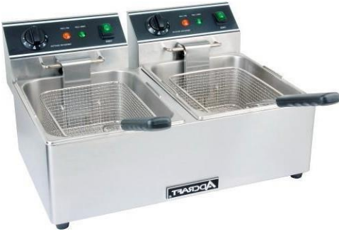
Deep Fat Fryer (Table Top) Single / Double Cap. 4 to 18 ltr.