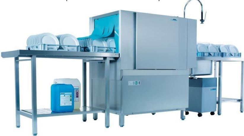
Rack Conveyor Dish Washer Cap. 155 Rack/hour