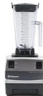
2 Speed Blander