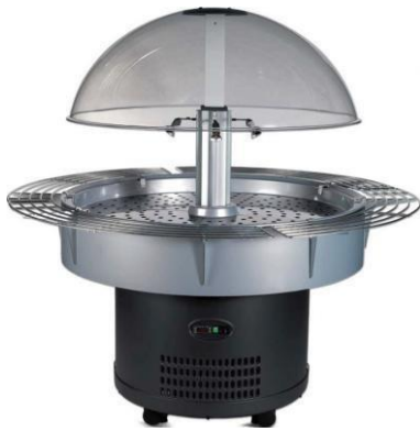
Salad Counter Size : Customized