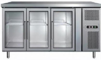
Glass Door Under Counter (Back Bar Chiller) Size : Customized