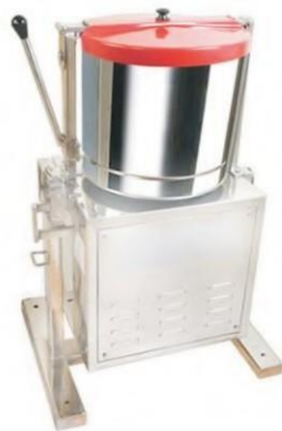
Tilting Wet Grinder (Electric) Cap. : 5 to 30 Ltr.