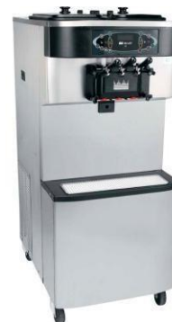
Model : C712 / 713