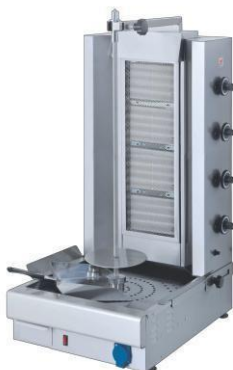
Shawarma Grill (Gas/Electric) Size: 2 To 4 Burner