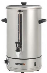
Water / Milk Boiler (Customised/Imported) Cap. 10 to 40 ltr.