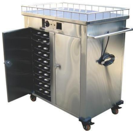
Hot Food Service Trolley Size : Customized