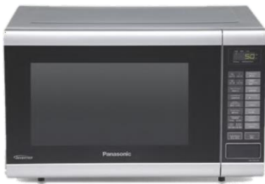
Microwave Oven Branded Cap. 15 to 30 ltr.