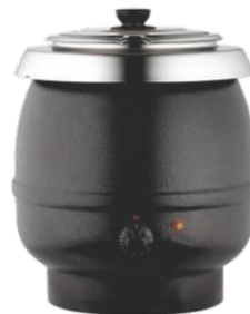
Soup Kettle Standard/Branded Cap. 7 to 15 ltr.