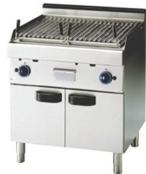
Lava Grill/Stone (Gas / Electric) SIZE: Customized/Important