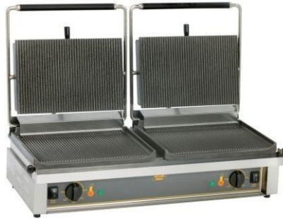
Sanwich Griller (Electric) Single / Doble (STD/Jambo)