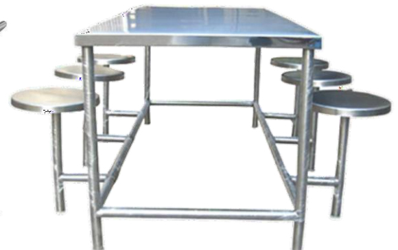
Dinning Table with Seater Size : Customized