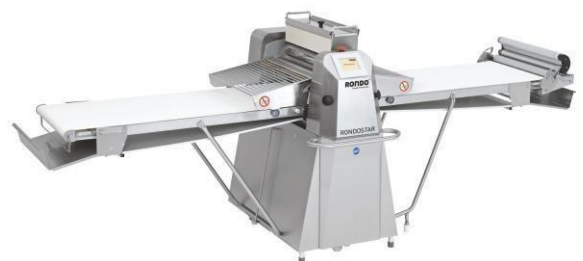
Dough Sheeter (Electric) Table / Floor Model