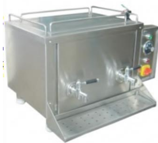
Tea Milk Dispenser (Size : Customised)