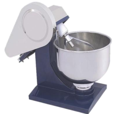
Dough Kneader (Electric) Cap. 5 to 100 ltr.