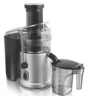
Juicer Mixer Standard/Imported