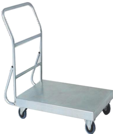
S.S. Platform Trolley Size : Customized