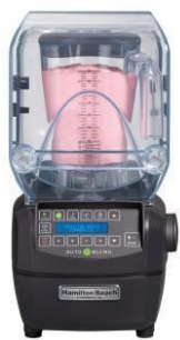
Commercial Summit Blander