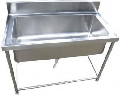
Pot Wash Unit Size : Customized