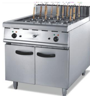
Pasta Cooker (Gas / Electric) Size : Customized