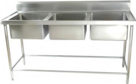
3 Sink Dish Wash Unit Size : Customized