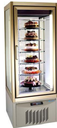
Vertical Display Counter Size : Customized