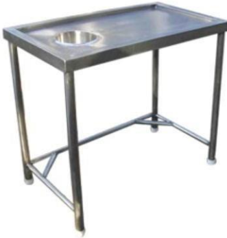
Dirty Dish Landing Table Size : Customized