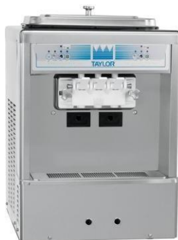
Model : 161