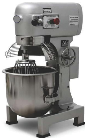
Planetary Mixer Cap. 5 to 80 ltr.