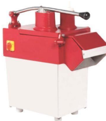
Vegetable Machine (Electric) Cap. 40 to 200 kg./hr.