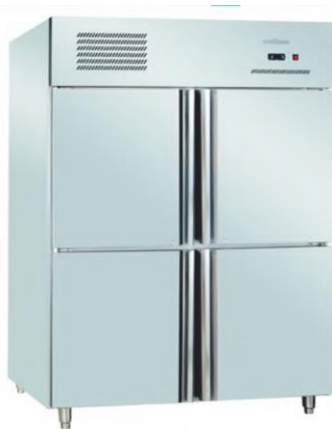
Vertical Four Door (Refrigerator / Freezer) Cap. 800 to 1200 Ltr.