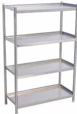
Storage / Clean Dish Rack Size : Customized