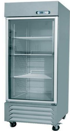
Visi Cooler Capacity : 300 to 500 ltr. (Branded)