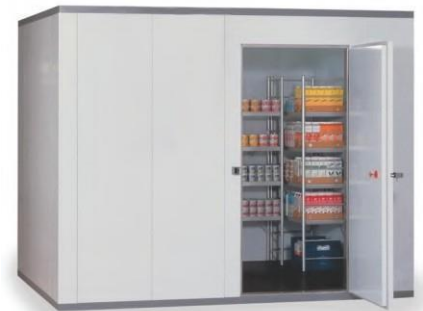
Walk in Chiller / Walk in Freezer Size : Customized