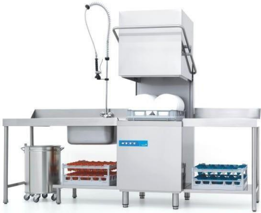
Hood Type Dishwasher Cap. 60 Rack/hour

Dishwasher range is ideal for high volume catering & hospitality dishwashing perfect for the busy commercial kitchenware washing area v Under counter Dish & glass washer v Hood Type Dishwashing Machine v Rack Conveyor Dishwashing Machine