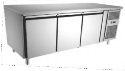
3 Door Under Counter Refrigerator / Freezer Size : Customized