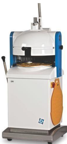
Dough Divider / Rounder (Electric)