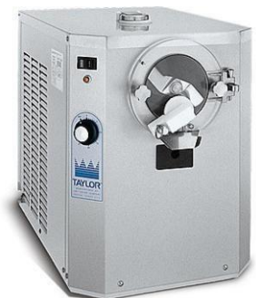
Model : 104