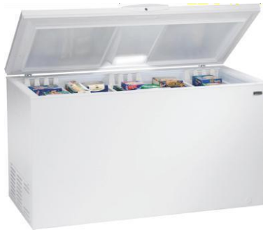
Chest Freezer (Deep Freezer) Cap. 100 to 1000 Ltr. (Branded)