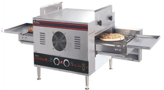
Conveyor Pizza Oven Electric / Gas Imported