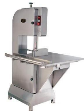
Bone Swa (Electric) Blade : 16/20 mm