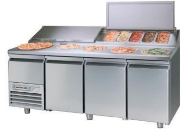
Under Counter (Pizza Makeline) Refrigerator / Freezer Size : Customized