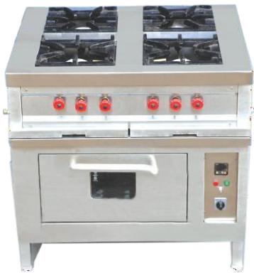
4 Burner Range With Oven Size: Customized