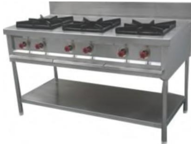
Three Burner Range Size: Customized