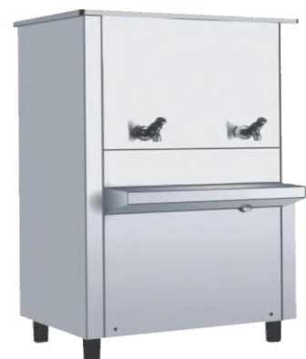
Water Cooler Cap. 25 to 1000 ltr.