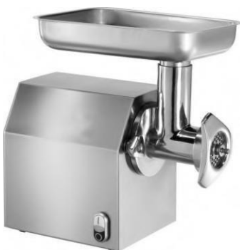
Meat Mincer (Electric) Cap. 20 to 150 kg. / hr.