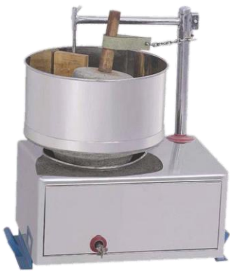
Wet Masala Grinder (Electric) Cap. 5 to 25 ltr.