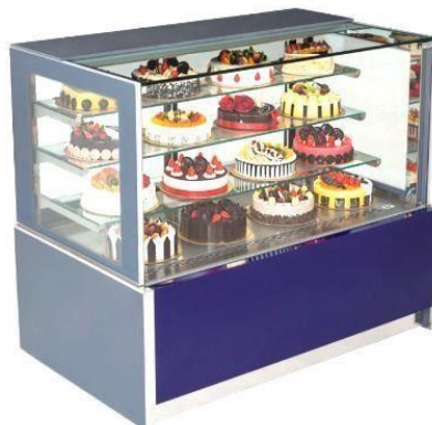
Bakery / Sweet Display Counter Size : Customized