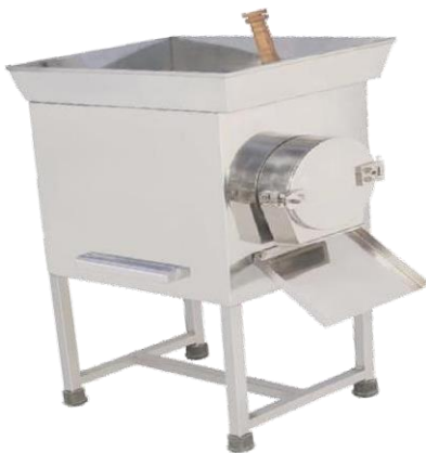
Pulverizer (Electric) Cap. 2 / 3 / 5 HP.