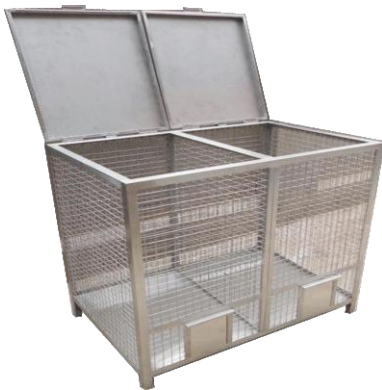
Onion / Potato Bin Size : Customized