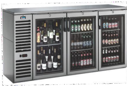
Three Door Back Bar Chiller Size : Standard (Imported)