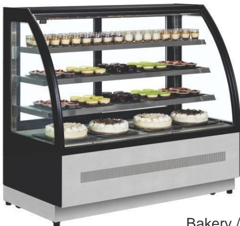
Bakery / Sweet Display Counter Size : Customized