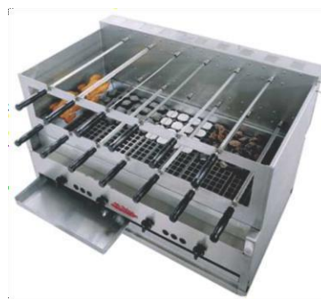
Charcoal Grill (Charcoal / Gas / Electric) Size: Customized