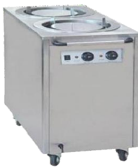
Plat Warmer (Electric) Single / Double Cap. 50 to 100 Plates