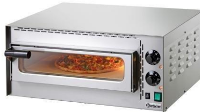
Pizza Oven Electric / Gas (Customised/Imported)