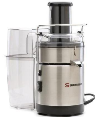
Licuandora Multi Juicer