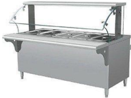
Hot Bain Marie with Sneeze Guard & Tray Slide Size : Customized