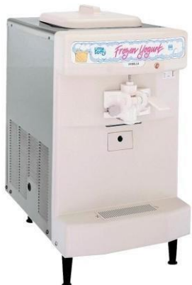
Model : 142