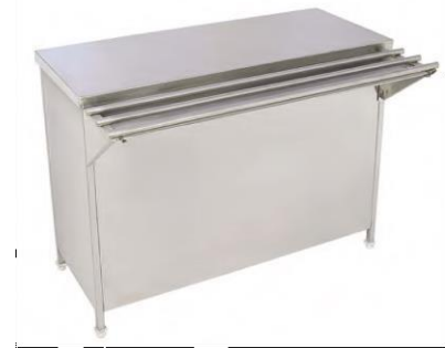
Cutlery Counter with Tray Slide Size : Customized