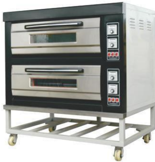
2 Deck Baking Oven (Gas / Electric)