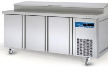
3 Door Under Counter (Pizza Makeline) Refrigerator / Freezer Size : Customized