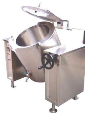
Bulk Cooker (Rice Boiler) Capacity : 50 To 250 Ltr.