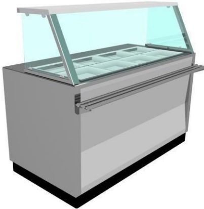
Bain Marie (Hot/Cold) Front Glass & Tray Slide Size : Customized