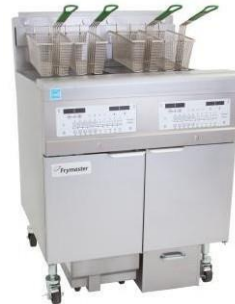
Deep Fat Fryer