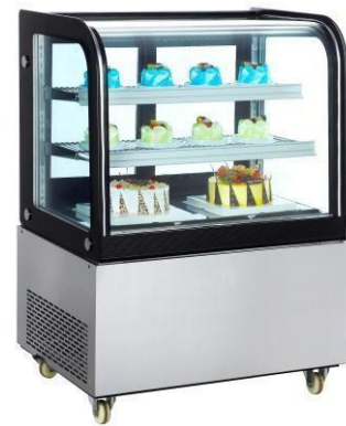
Bakery / Sweet Display Counter Size : Customized