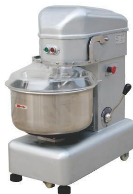
Spiral Mixer Cap. 5 to 80 ltr.