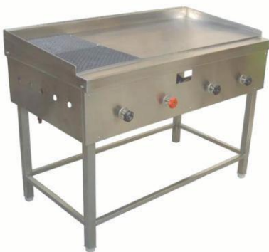
Chapati Plate With Puffer Size: Customized