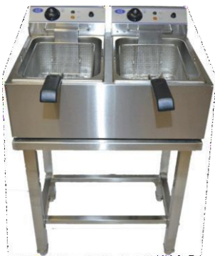
Deep Fat Fryer (Gas / Electric) Cap.: 8 to 20 Ltr.