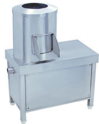
Potato Peeler (Electric) Cap. 5 to 50 kg.