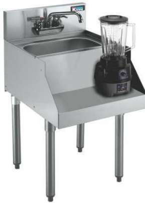
Blender Station with Sink & Tap Size : Customized