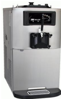
Model : 706