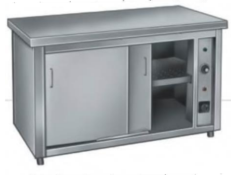
Hot Food Pick up Counter Size : Customized