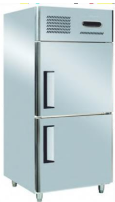
Vertical Two Door (Refrigerator / Freezer) Cap. 400 to 600 Ltr.