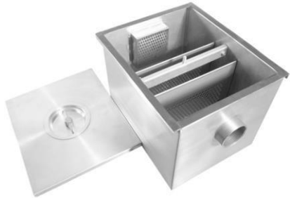
Grease Trap Customized