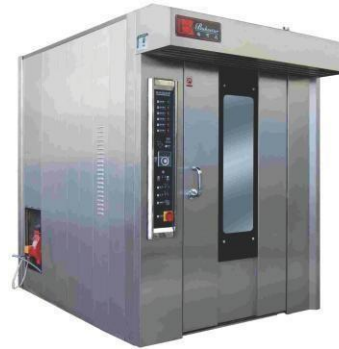
Rotary Oven (Gas / Electric)