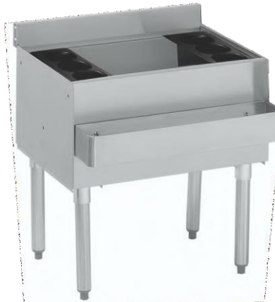
Cocktail Station with Speed Rail Size : Customized