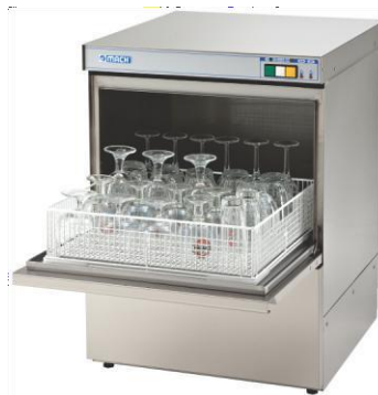
Glass Washer Cap. 30 to 40 Rack/h Size : Standard (Imported)