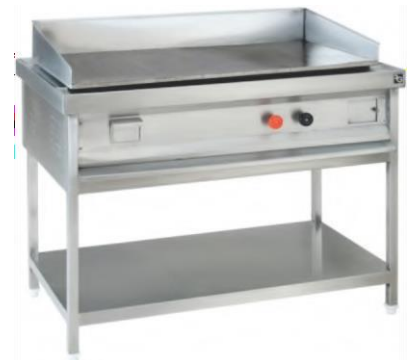
Dosa Plate Size: Customized