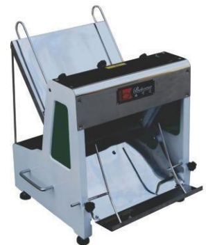
Bread Slicer (Electric) Table / Floor Model

Keep sincere & honest; identify right & wrong, harmonious to concern each other, to unit together, to develop benefit for share with customers' subcontractor, colleague, stockholder and publics in the country.