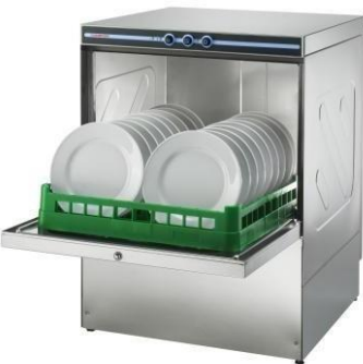
Under Counter Dishwasher Std/Imported