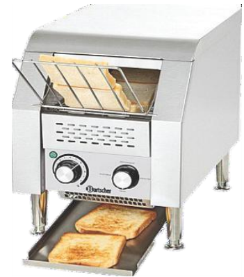
Conveyor Toaster (Electrical) (150 / 300 Slice)