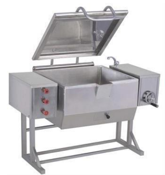
Tilting Brazing Pan Capacity : 50 To 200 Ltr.