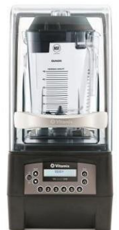
The Quiet Blander