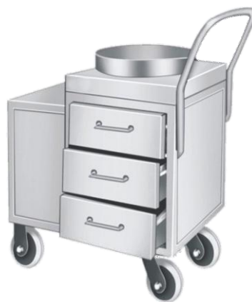
Tea Service Trolley Size : Customized