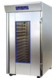
Proofing Chamber (Electric) Customized