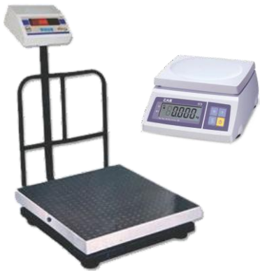
Weighing Scale Cap. 10 to 500 kg.