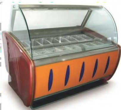
Ice Cream Parlor Size : Customized