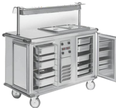
Hot Food Service Trolley Size : Customized