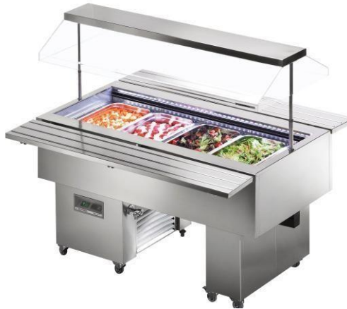
Salad Counter Size : Customized