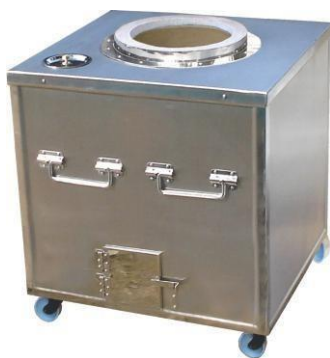
SS Mobile Tandoor (Gas / Charcoal) Size: Customized