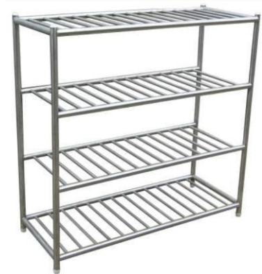
Pot Rack (Pipe Rack) Size : Customized