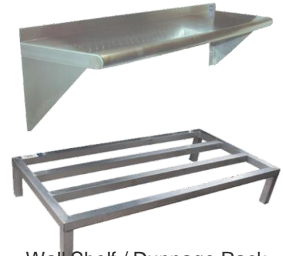
Wall Shelf / Dunnage Rack Size : Customized