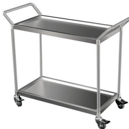
S.S Utility Trolley Size : Customized