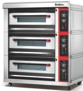
3 Deck Baking Oven (Gas / Electric)