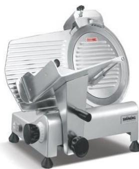
Meat Slicer (Electric) Slice : 150 to 300 mm