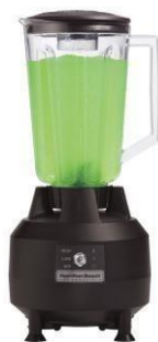
2 Speed Blander