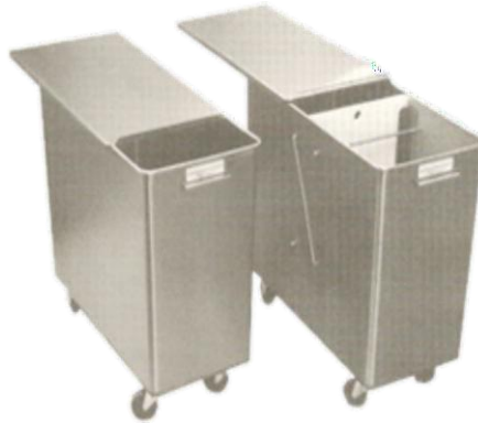
Ingredient Bin (Atta Bin) Size : Customized