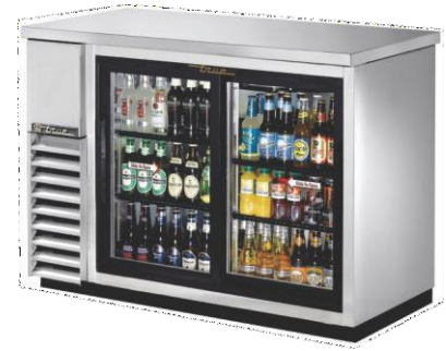
Two Door Back Bar Chiller Size : Customized (Imported)