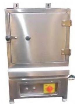
Idli Steamer (Gas / Electric) Cap. : 36 to 250 Itli