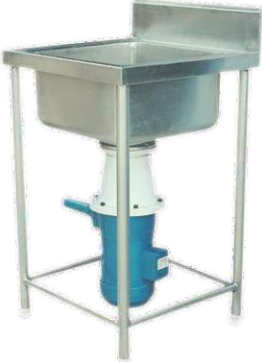
Garbage Crusher Cap. 1 to 5 HP