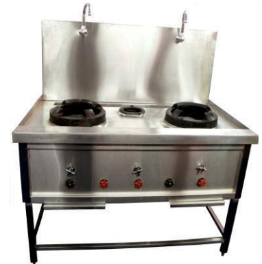
Three Burner Chinese Range Size: Customized